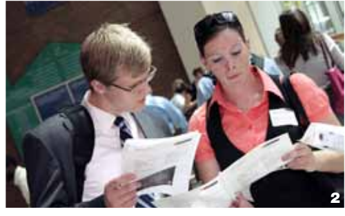
PHOTO 1: Trent Lott, Former Senate Majority Leader, during a C-SPAN class taping. PHOTO 2: Students checking into the Fall 2011 Career Boot Camp at the National Housing Building.