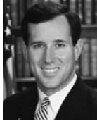
THE HONORABLE RICK SANTORUM (R-PA) U.S. SENATE

The Honorable Rick Santorum has served in the United States Senate since January 1995. During this time, he has served as a champion for Pennsylvanians, either through his accomplishments in the United States Senate or through his leadership position as Republican Conference Chairman, the party's third-ranking leadership position in the Senate.