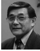
THE HONORABLE NORMAN Y. MINETA U.S. SECRETARY OF TRANSPORTATION

The Honorable Norman Y. Mineta became the 14th U.S. Secretary of Transportation on January 25, 2001. As Secretary, he oversees an agency with almost 60,000 employees and a $61.6 billion budget.