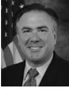
THE HONORABLE DENNIS CARDOZA (D-CA) U.S. HOUSE OF REPRESENTATIVES

The Honorable Dennis Cardoza has played a prominent role in representing the people of California's Central Valley. In his second term, he has taken bold steps to end the death tax, and support Valley farmers and establish UC Merced. He serves on the House Committee on Resources and the House Committee on Agriculture, arguably the two most critical committees for the Central Valley. He is a member of the Committee on International Relations, the Democratic Steering and Policy Committee, and serves as a Senior Whip. He is also co-chair of the Blue Dog Coalition.