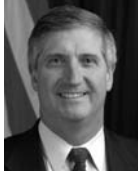
THE HONORABLE ANDREW H. CARD FORMER BOARD MEMBER, THE WASHINGTON CENTER

The Honorable Andrew H. Card, Jr., was appointed to serve in the presidential administration of Texas Governor George W. Bush on November 26, 2000.