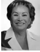
THE HONORABLE ELBA ESTHER GORDILLO CHAIR, NATIONAL EXECUTIVE BOARD, SNTE

The Honorable Elba Esther Gordillo was born in Chiapas, Mexico, graduated as a school teacher, is a social fighter, and one of the most outstanding women in Mexico's political arena and public life. She has been a member of the National Education Workers' Union (Sindicato Nacional de Trabajadores de la Educación -SNTE) since 1960. In April of 1989 she was elected General Secretary of this union and in March of 2004, the national Chair. She has promoted the Union's modernization and aperture by heading a plural, democratic and pro-active leadership.